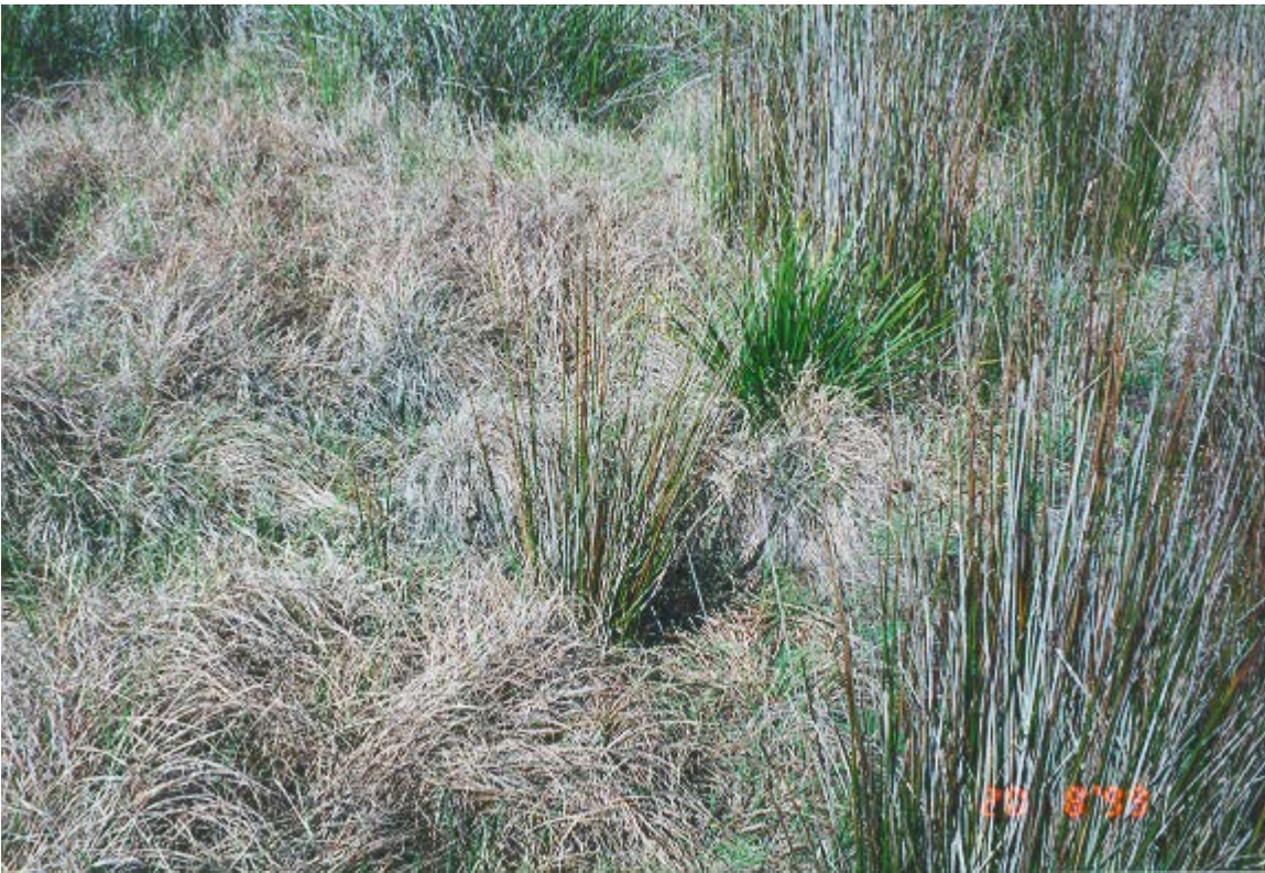
Figure 4. Dense mat of vegetation which provides shelter for a number of frog species.