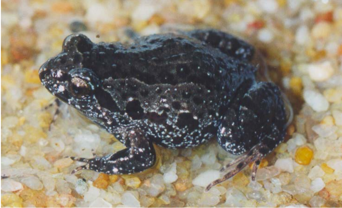
Figure 1. The Smooth Frog Geocrinia laevis collected from Canunda National Park.

Despite the occasional museum record and the capture of a small number of specimens during a Biological Survey of swamps in the region (Foulkes 1998), no major reports of this frog have been made since the Beck survey. The purpose of this study was to conduct field surveys to document the distribution and status of G. laevis in South Australia.