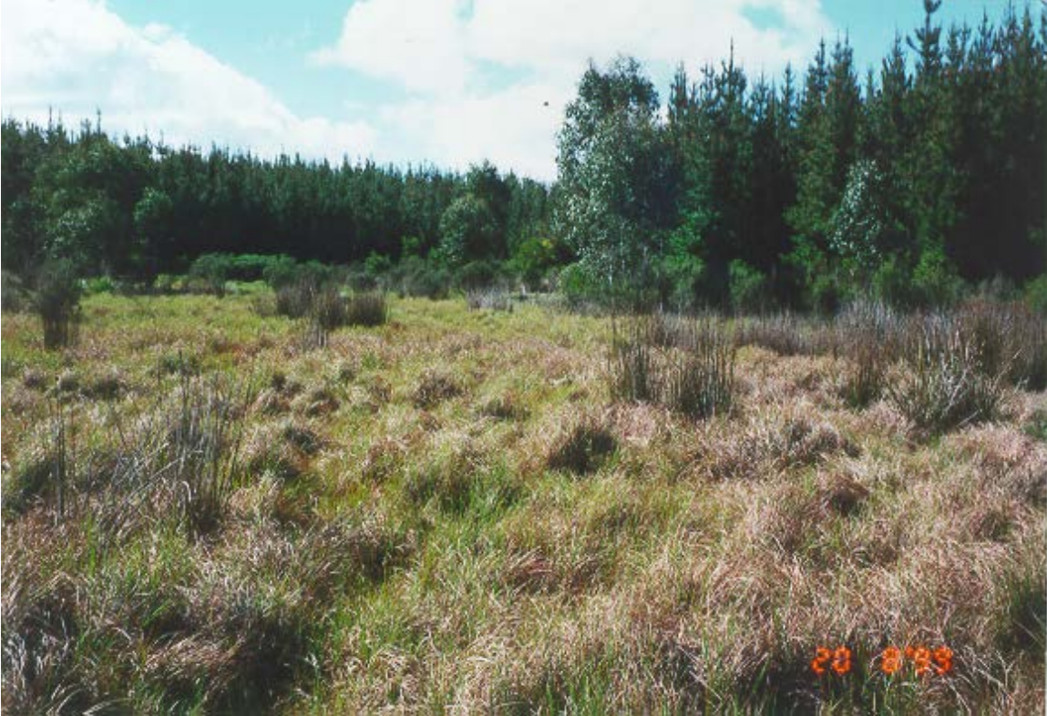
Figure 3. Clearing in Mt Burr Forest, typical habitat of Geocrinia laevis in the South East of South Australia.