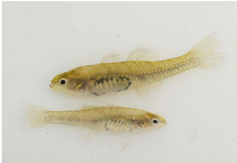
Figure 41 Carp Gudgeon. Retention Dam, Leigh Creek.

This generally widespread but locally restricted Secure arid-adapted near-bottom species ( Hypseleotris klunzingeri ) can tolerate a range of salinity and temperature and occurs in a few low-gradient waterbodies around the Flinders Ranges. It is known from Saint Marys Pool and the Leigh Creek Retention Dam.