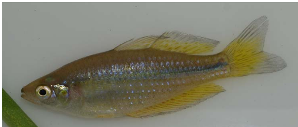
Figure 39 Desert Rainbow Fish, St Mary's Pool, MacDonnell Creek.

This generally widespread but locally restricted Secure arid-adapted mid-water species ( Melanotaenia splendida tatei ) is to date in the Flinders Ranges area only known from the Saint Marys Pool group of waterbodies in MacDonnell Creek and from Myrtle Springs. It is probably has narrower ranges of tolerance for temperature and salinity than other arid-adapted species.