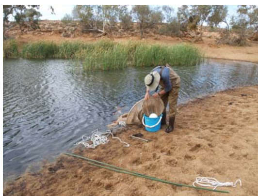
Figure 15 Site 14, main upstream pool St Mary's Pool complex, MacDonnell Creek. Clearing the fyke net into sorting bucket.

Twelve voucher specimens of three species of frogs (the northern undescribed taxon of Flinders Ranges froglet Crinia sp nov, the Spotted Marsh Frog Limnodynastes tasmaniensis , and the Desert Tree Frog Litoria rubella ) and about 35 voucher specimens of seven species of fishes have been lodged in the South Australian Museum. See Table 4.