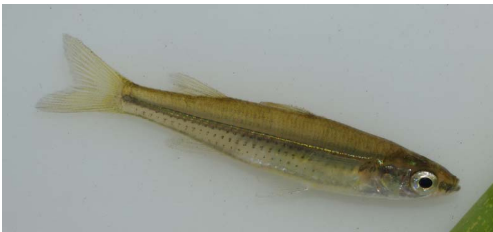
Figure 38 Fly-specked Hardyhead, St Mary's Pool, MacDonnell Creek.

This very restricted Vulnerable mid-water schooling species ( Craterocephalus stercusmuscarum taxonomic status uncertain) is to date in South Australia only known from the Saint Marys Pool group of waterbodies in MacDonnell Creek. It probably has narrower ranges of tolerance for temperature and salinity than Craterocephalus eyresii .