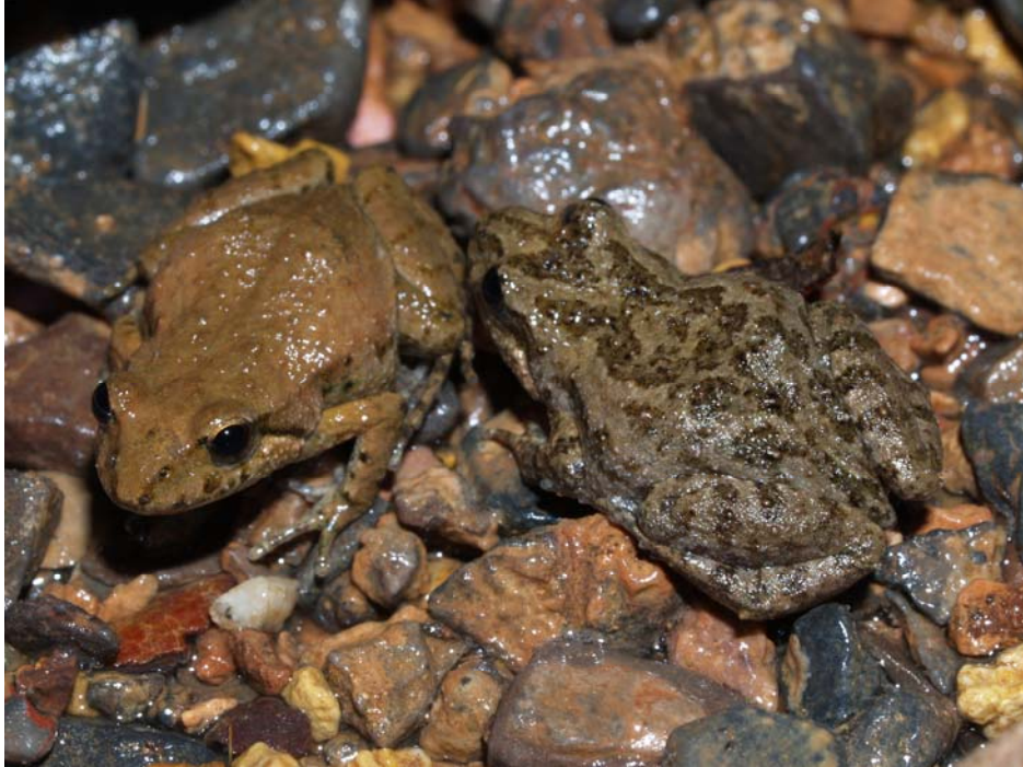
Figure 28 Flinders Springs Froglet ( Crinia sp nov) Narrina Spring. Smooth back morph on left and lyrate back morph on the right.

The Flinders Stream Froglet ( Crinia riparia ) and the Flinders Springs Froglet ( Crinia sp. nov.)