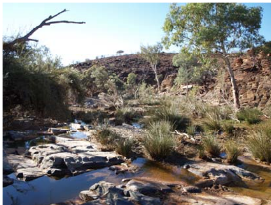
Figure 3 Site 3, Angaroooy Springs, upstream and north of the main deeper cliff-base pools.