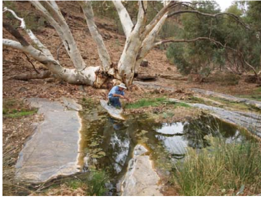
Figure 5 Site 5, Narrina Spring and deep rock pools. Searching for Crinia sp nov.