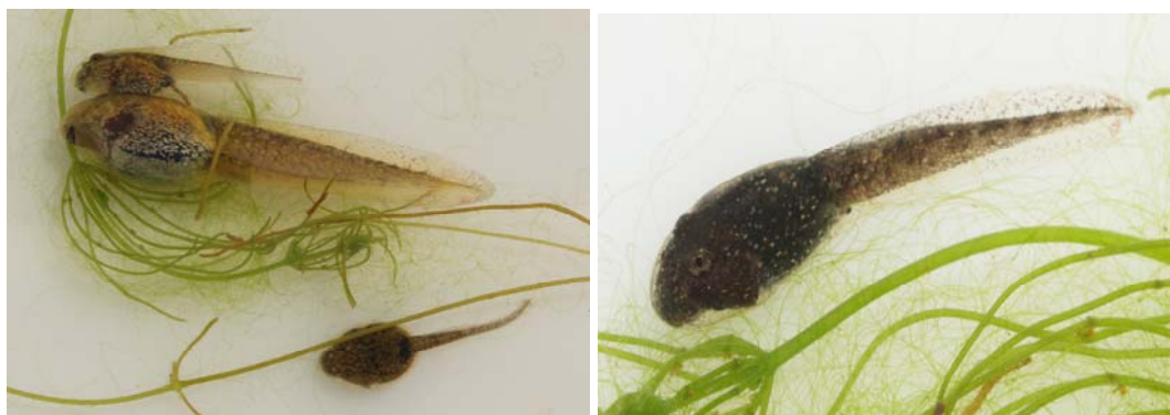
Figure 30 (left) Site 24 two small and one large paler Crinia sp nov tadpoles, note distal tail damage in smaller tadpoles, due to dragonfly larvae predation attempts. From deep main pool.

The persistent drought conditions during this pilot study limited the amount of work that could be done on the Flinders Springs Froglet ( Crinia sp. nov.). None-the-less its known distribution was extended northward to Walparindina Springs on Mount Freeling Station. This location confirms the species in the northward-flowing MacDonnell Creek which is part of the Lake Blanche/Strzelecki Creek sub-drainage of the lake Eyre Basin. This creek system is also important for fishes and highlights the need for further evaluations and better management of the biodiversity of the northward flowing watercourses.