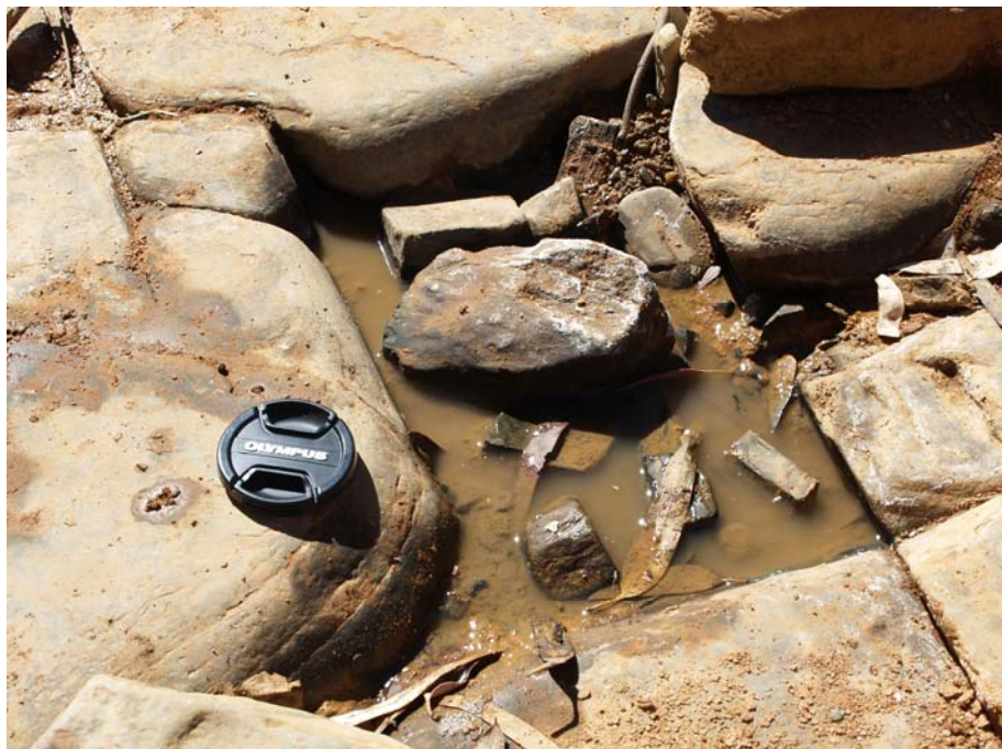
Figure 27 Site 24, Walparindina Springs and pools, MacDonnell Creek. A small landlocked rock pool with approximately 500ml of water (shaded most of the day). It contained about 20 large Crinia sp nov tadpoles (two visible in water near the lens cap) in average condition but with little or no tail damage.