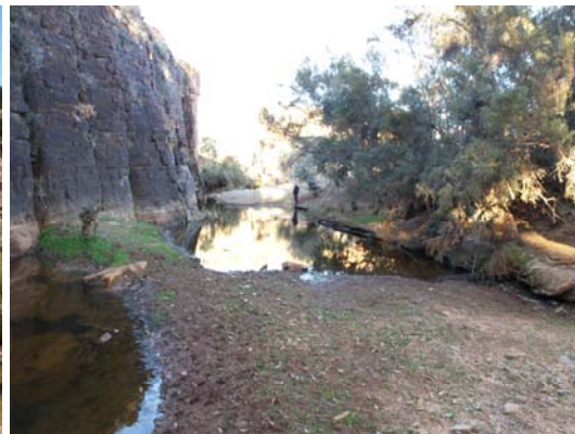
Figure 4 Site 4, Angaroooy Springs, deeper cliff-base pools downstream and south of the extensive in-stream springs.