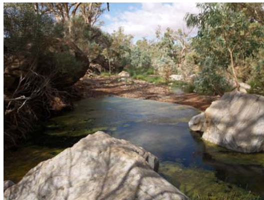
Figure 10 Site 9, Nepowie Spring creek pool looking downstream to the east.

The 26 visited sites and their field-assessments are given in Table 3. Most sites examined were also photographed and some of these are in Figures 1 to 27.