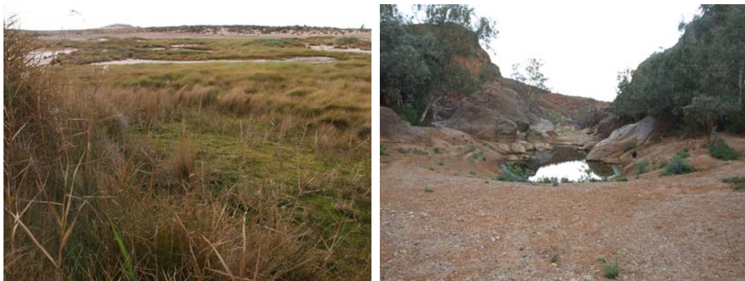
Figure 23 (left) Site 23, Twelve Springs complex, to Yerila Creek. Moolawatana Station.