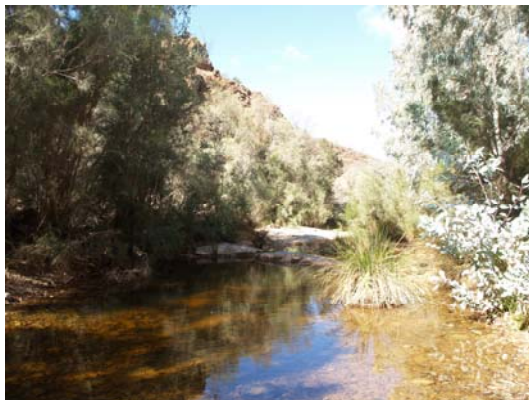
Figure 9 Site 8, Moro Gorge Creek (nearby spring fed) at vehicle crossing.