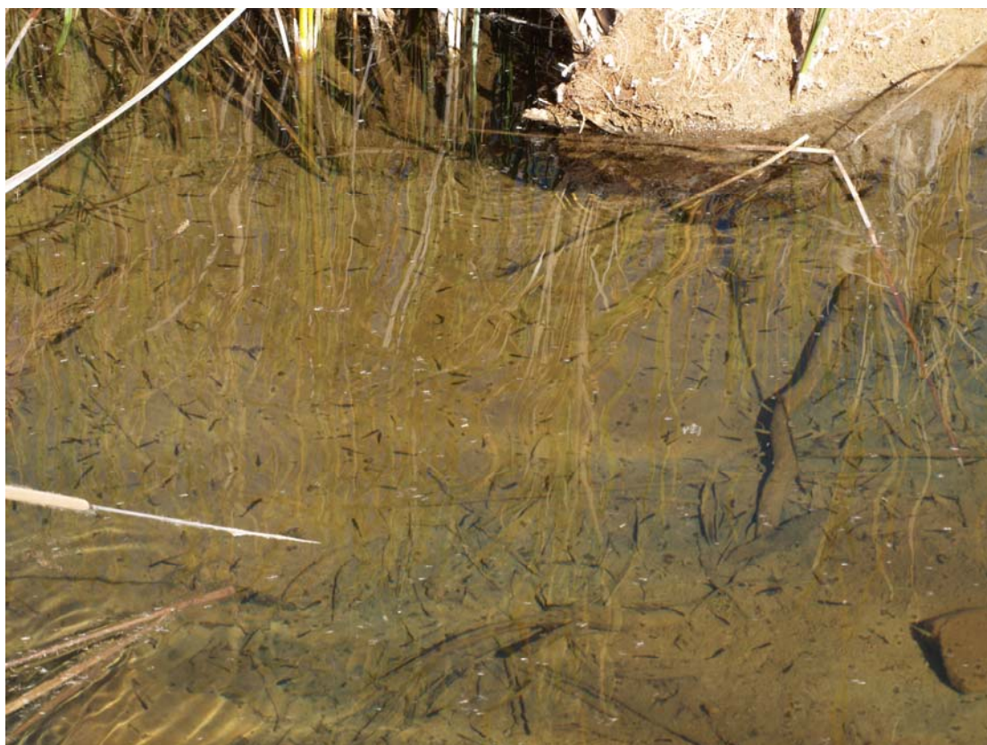
Figure 43 A large number of Plague Minnows ( Gambusia holbrooki ). Aroona Creek picnic area, 800 m downstream from Dam. The black fish shapes are the fishs' shadows, actual fish are easiest to see when they directly in line with shadowed substrate (see shadows of stick and rock).

The introduced pest Plague Minnow ( Gambusia holbrooki ) seems not to be widespread in the Flinders Ranges. This aggressive surface schooling fish that can tolerate wide fluctuations in temperature and oxygen availability is highly invasive and almost useless as a mosquito larvae control species.