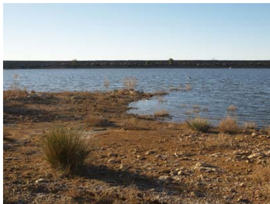
Figure 13 Site 12, Retention Dam, Leigh Creek.