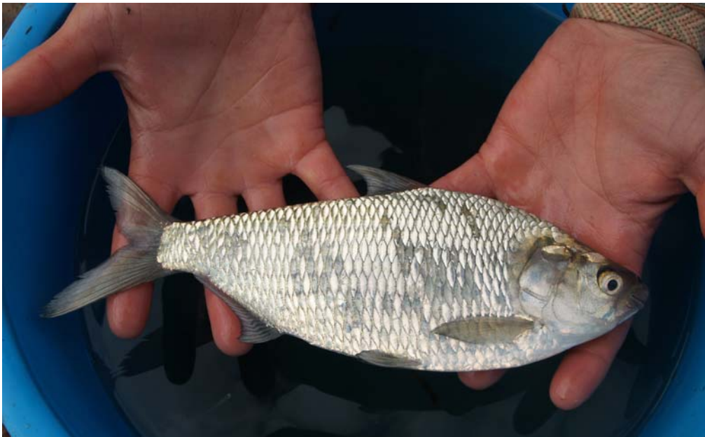
Figure 36 Bony Bream, St Mary's Pool, MacDonnell Creek.

This widespread arid arid-adapted Secure mid-water and near-bottom species ( Nematolosa erebi ) occurs in many deeper waterbodies that are flow-linked to refugia waterholes during rains.