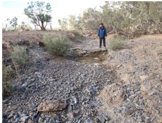
Figure 8 Site 7, Big Spring creek bed with massive natural concrete associated with past sustained waterflows. Pool of recent rainwater.