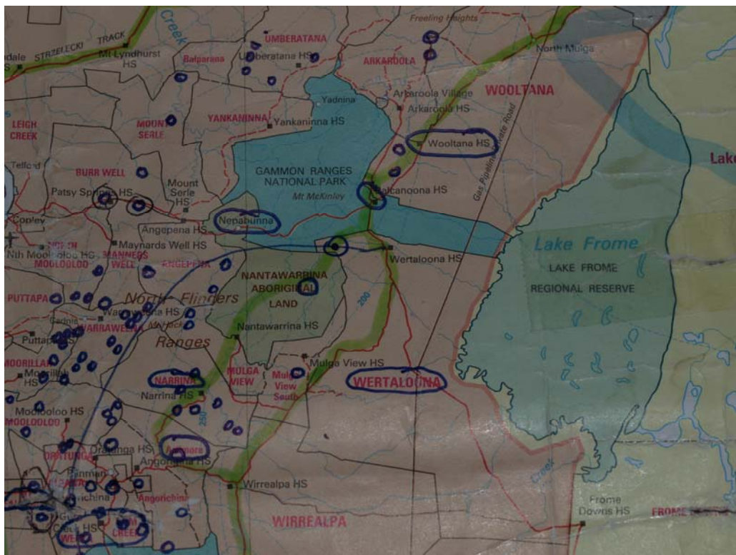
Northern and southern Gammon Ranges area on the Pastoral map of South Australia, with mark-up showing surface waters of significance (mostly springs) transposed from old pastoral mapping (blue circles). Some property names and towns are also encircled in blue.