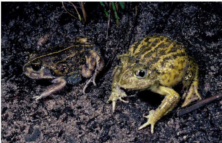
Figure 34 Painted Trilling Frogs, male on left, female on right.

This Secure burrowing species ( Neobatrachus pictus ) is largely distributed to the south of the Flinders Ranges but does get into their southern half. It occurs in areas with softer homogeneous soils esp. sandy clays on plains and footslopes. It is a winter breeder. The species is mostly cryptic and remains underground in its own vertical back-filled shaft during dry weather, but following winter rains it is active on the surface. At such times it is not as explosively abundant as the Desert Trilling Frog (Ehmann 2007).