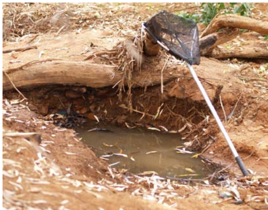
Figure 1 Site 1, Parawilia Waters. This was the only surface water at this site.

The number of mapped springs and other surface waters that are potentially suited to frogs and fishes in the Flinders Ranges and its environs are summarised in Table 2. These numbers should be used only as guide and with caution as mapping may not be correct or reflect current conditions. The overall numbers are relatively accurate (probably within 10%) and are indicative of the task involved in adequately assessing these Desert Jewels in the Flinders Ranges and their environs.