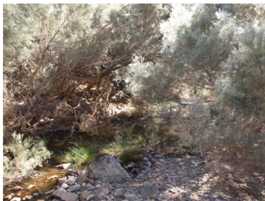
Figure 11 Site 10, Aroona Creek pool 250 m downstream of Dam.