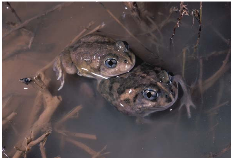
Figure 33 Breeding Desert Trilling Frogs in amplexus.

This widespread arid-adapted Secure burrowing species ( Neobatrachus centralis ) occurs in areas with softer homogeneous soils esp. sands on plains and footslopes associated with the Flinders Ranges. It is an opportunistic breeder with a preference to breed in warmer months. The species is mostly cryptic and remains underground in its own vertical back-filled shaft during dry weather, but following rains many