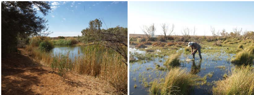
Figure 17 (left) Site 15, gauging station pool St Mary's Pool complex, MacDonnell Creek. Dense fringing Phragmites australis .

Also of concern is that many of the 11 Great Artesian Basin springs examined showed some signs of declined flows, one was extinct (Petermorra), while one appears not to have diminished in the very recent past. Nepowie Spring was the only one in which the flow rate and tail were not diminished compared to a previous visit in 2002, however its longer term (past) flow rates are not known. Other lesser springs (presumed to be GAB-fed) in the general area near Nepowie are known to have diminished or ceased in flow.