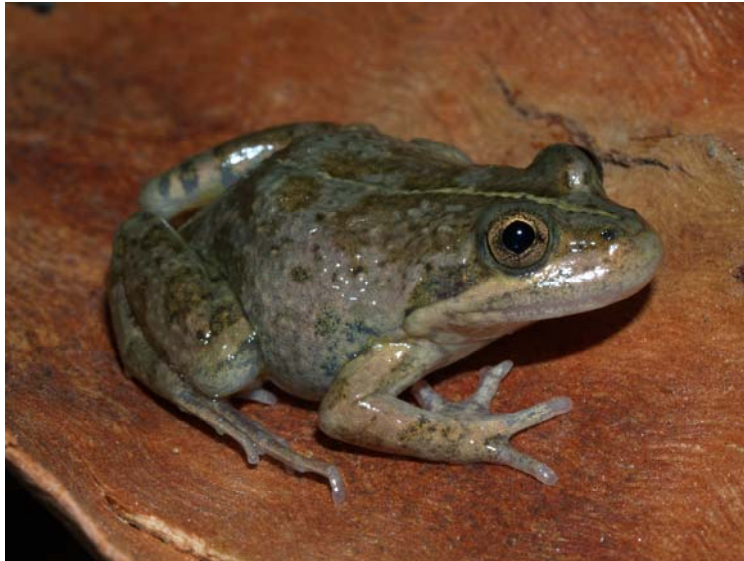
Figure 32 Spotted Marsh Frog ( Limnodynastes tasmaniensis ). Parawilia Waters.

This widespread Secure species ( Limnodynastes tasmaniensis ) occurs in more reliable watercourses in the ranges and some associated lower lands and plains where it can shelter in deep well-shaded refuges. It is an opportunistic breeder with a preference to breed in cooler months.