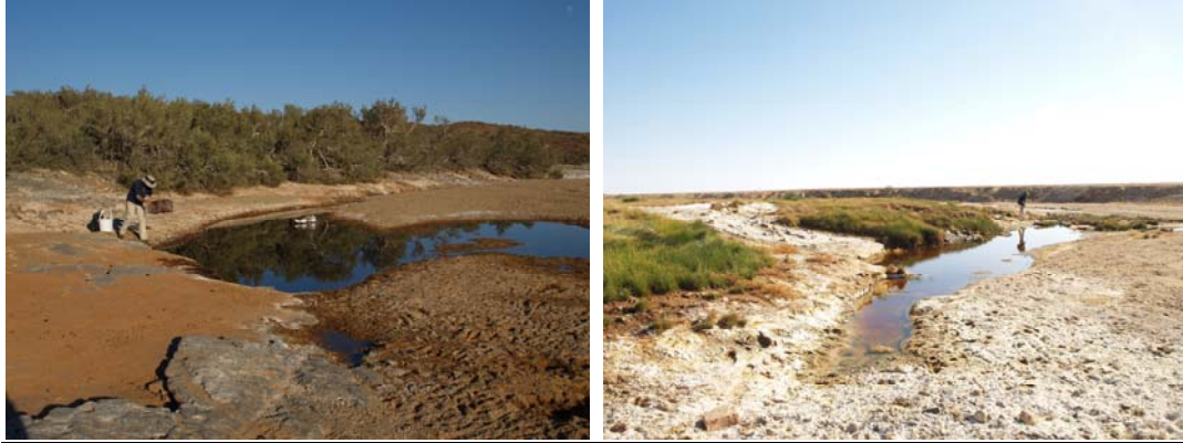
Figure 19 (left) Site 17, first Chimney Springs, Petermorra Creek. Setting fish trap.