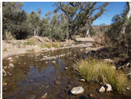
Figure 12 Site 11, Aroona Creek pool 800 m downstream of Dam..