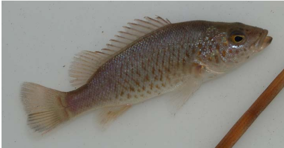
Figure 40 Spangled Grunter, St Mary's Pool, MacDonnell Creek.

This most widespread arid arid-adapted Secure mid-water species ( Leiopotherapon unicolor ) can tolerate a wide range of water quality and is very aggressive towards other species. These characteristics help to explain its sole persistence in many drought-reduced waterbodies and why smaller species disappear. It occurs in flow-linked refugia waterholes and during and following rains and it has remarkable capacities to disperse to other water bodies in rain-flooded country.