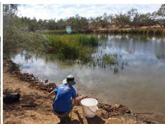
Figure 14 Site 14, main upstream pool St Mary's Pool complex, MacDonnell Creek.