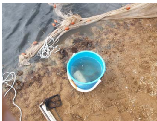
Figure 16 Site 14, Bucket with fish and hiding tubes. Hand net and measuring frame below the bucket.