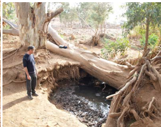
Figure 2 Site 2, Prelinna Hut Spring at the time of visit. Reduced to depression in the creek bed.