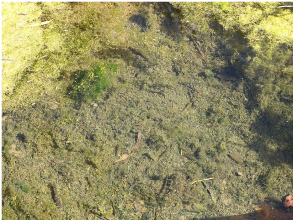
Figure 42 Flinders Ranges Purple-spotted Gudgeon ( Mogurnda clivicola ). Nepowie Spring. There are at least 10 individual fish in this photograph of an 80 X 60 cm opening in algal in-water growth.