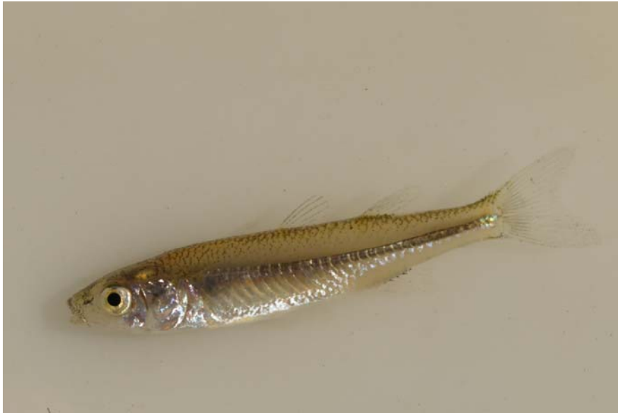
Figure 37 Lake Eyre Hardyhead. Retention Dam, Leigh Creek

This widespread arid arid-adapted Secure mid-water schooling species ( Craterocephalus eyresii ) can tolerate a wide range of salinity and temperature occurs opportunistically in many waterbodies that are flow-linked to refugia waterholes during rains.