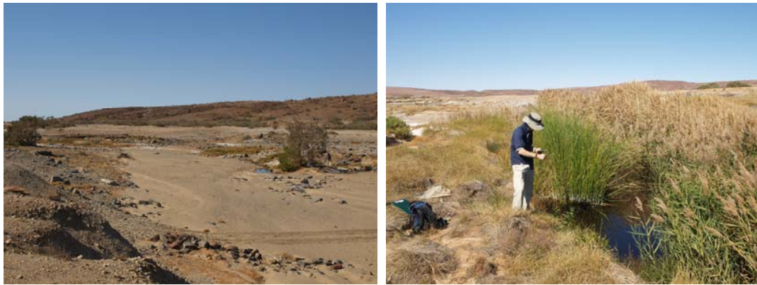
Figure 21 (left) Site 19, third Chimney Springs, Petermorra Creek. Several mound springs, vehicle crossing (tracks).