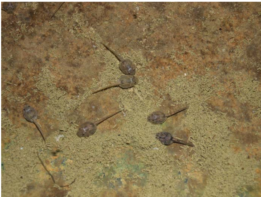
Figure 29 Flinders Springs Froglet ( Crinia sp nov) tadpoles. Angarooonoy Springs. Note tail damage in some due to dragonfly larvae attacks.