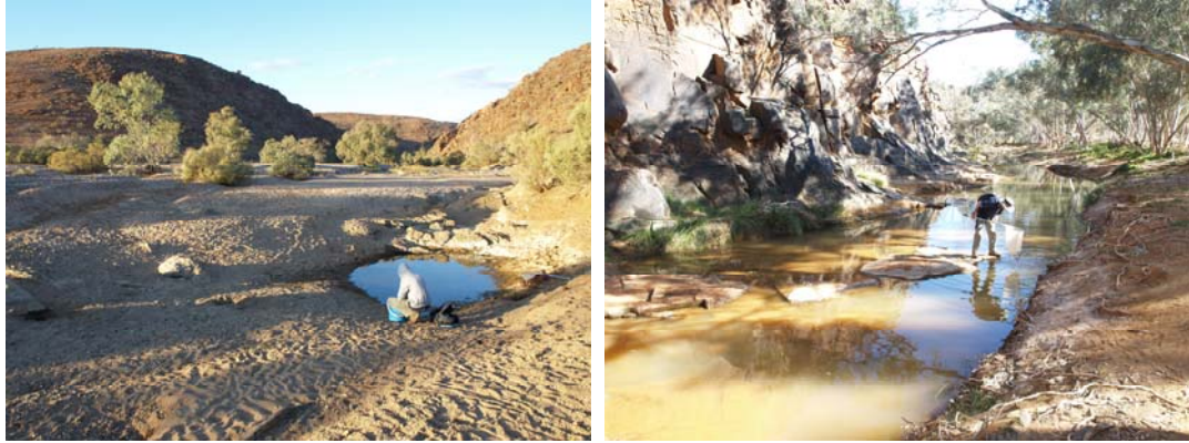
Figure 25 (left) Site 23, Brindana Springs and pool, Hamilton Creek. Mt Freeling Station.