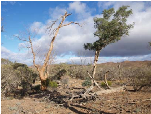
Figure 7 Site 7, Big Spring creek bed with extensive tree dieback and death probably due to sustained water stress.