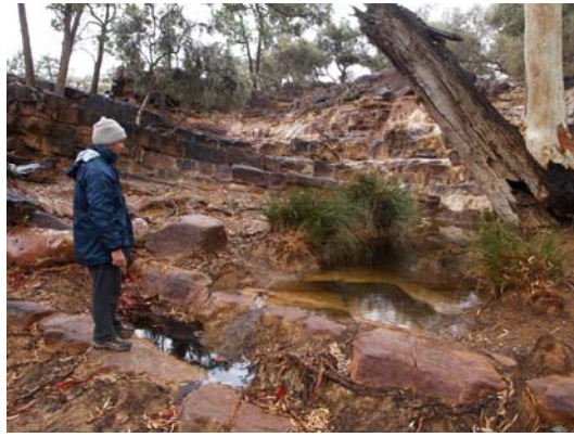
Figure 6 Site 6, Bora Bora Spring in background, with rain filled pools in foreground.