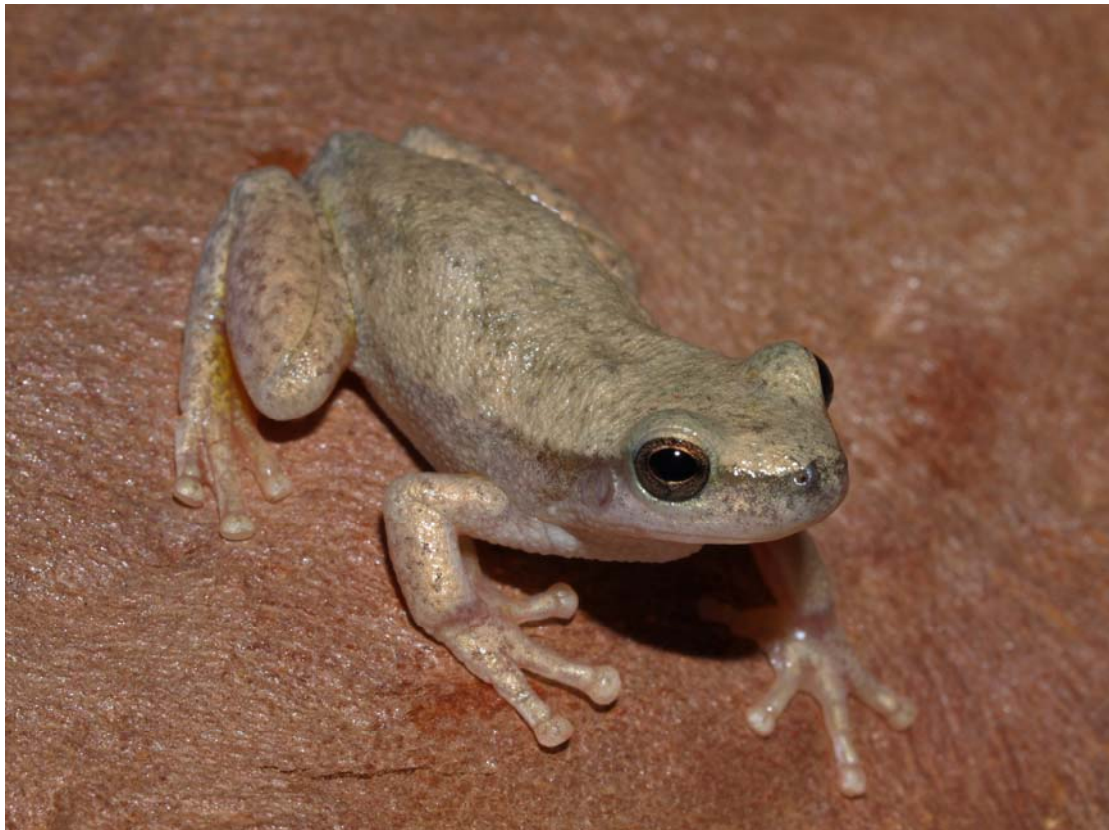
Figure 35 Desert Tree Frog ( Litoria rubella ). Big Spring.

This widespread arid-adapted Secure tree frog ( Litoria rubella ) is associated with substantial watercourses with larger trees in and surrounding the Flinders Ranges where it shelters in deep well-shaded tree hollows, deep recesses and under bark. It is an opportunistic breeder with a preference to breed in warmer months. The