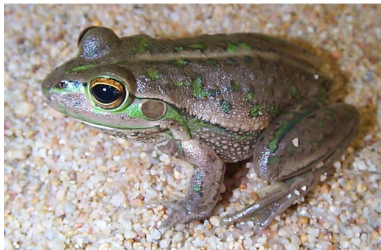
Figure 1 The Southern Bell Frog, Litoria raniformis , collected from Martin's Bend, Berri.

L. raniformis is not easily confused with any other species found in South Australia. It is a large frog (55–104 mm) characterised by a loud, barking call and distinctive, colourful skin patterns (Fig. 1); they have a pale green mid-dorsal stripe often with large, black spots on the green or brown back. The ventral surface is coarsely granular and the backs of the thighs are turquoise. The fingers are not webbed, but the toes are almost fully webbed (Barker et al 1995).