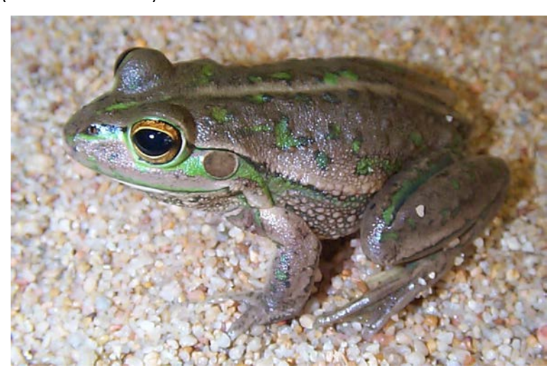
Figure 1 The Southern Bell Frog, Litoria raniformis, collected from Martin's Bend, Berri.

L. raniformis is not easily confused with any other species found in South Australia. It is a large frog (55–104 mm) characterised by a loud, barking call and distinctive, colourful skin patterns (Fig. 1); they have a pale green mid-dorsal stripe often with large, black spots on the green or brown back. The ventral surface is coarsely granular and the backs of the thighs are turquoise. The fingers are not webbed, but the toes are almost fully webbed (Barker et al 1995).