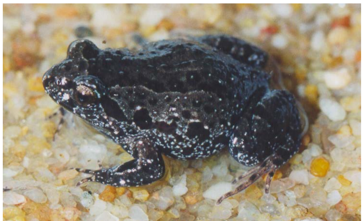
Figure 1. The Smooth Frog Geocrinia laevis collected from Canunda National Park.

Despite the occasional museum record and the capture of a small number of specimens during a Biological Survey of swamps in the region (Foulkes 1998), no major reports of this frog have been made since the Beck survey. The purpose of this study was to conduct field surveys to document the distribution and status of G. laevis in South Australia.