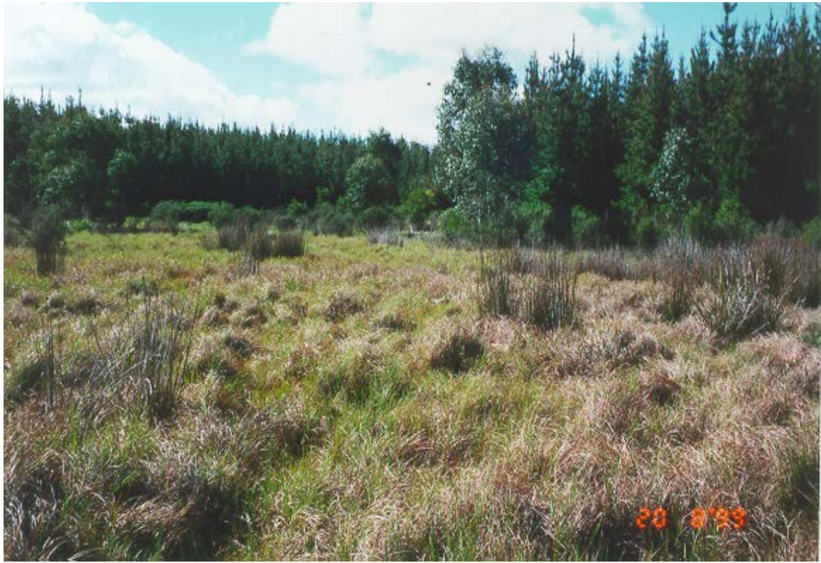
Figure 3. Clearing in Mt Burr Forest, typical habitat of Geocrinia laevis in the South East of South Australia.