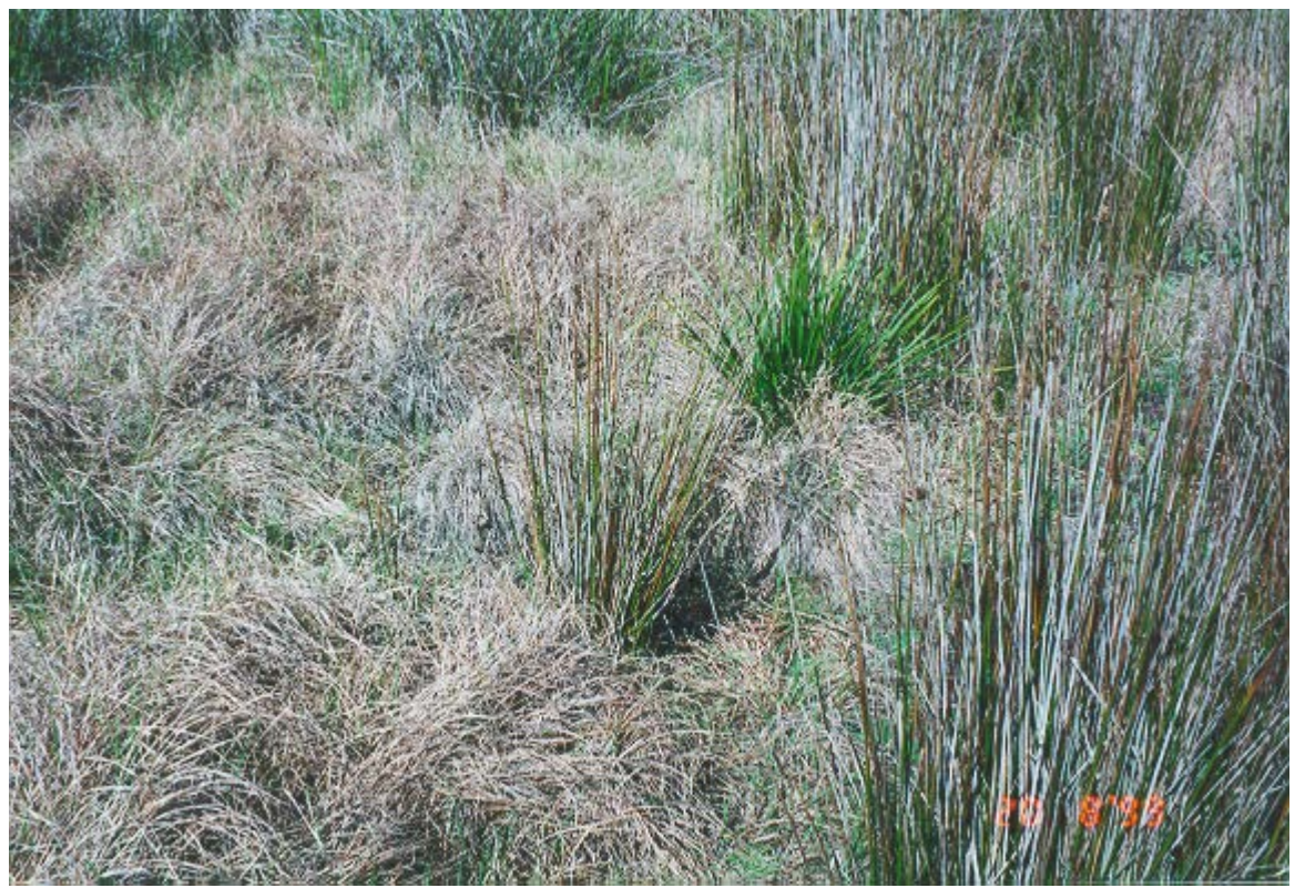
Figure 4. Dense mat of vegetation which provides shelter for a number of frog species.

Re-evaluation of the distribution of the Smooth Frog, Geocrinia laevis, in South Australia. January 2000