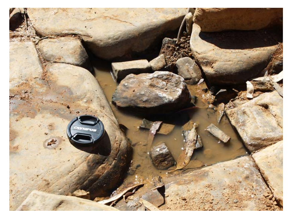
Figure 27 Site 24, Walparindina Springs and pools, MacDonnell Creek. A small landlocked rock pool with approximately 500ml of water (shaded most of the day). It contained about 20 large Crinia sp nov tadpoles (two visible in water near the lens cap) in average condition but with little or no tail damage.

Figure 25 (left) Site 23, Brindana Springs and pool, Hamilton Creek. Mt Freeling Station. Figure 26 (right) Site 24, Walparindina Springs and pools, MacDonnell Creek. Mt Freeling Station.