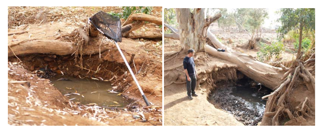
Figure 1 Site 1, Parawilia Waters. This was the only surface water at this site.

The number of mapped springs and other surface waters that are potentially suited to frogs and fishes in the Flinders Ranges and its environs are summarised in Table 2. These numbers should be used only as guide and with caution as mapping may not be correct or reflect current conditions. The overall numbers are relatively accurate (probably within 10%) and are indicative of the task involved in adequately assessing these Desert Jewels in the Flinders Ranges and their environs.