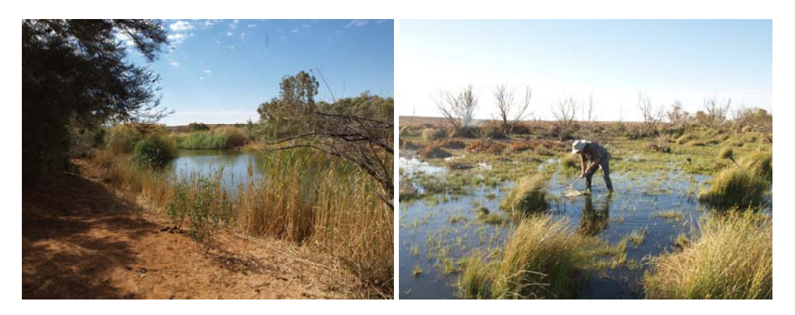
Figure 17 (left) Site 15, gauging station pool St Mary's Pool complex, MacDonnell Creek. Dense fringing Phragmites australis .

Also of concern is that many of the 11 Great Artesian Basin springs examined showed some signs of declined flows, one was extinct (Petermorra), while one appears not to have diminished in the very recent past. Nepowie Spring was the only one in which the flow rate and tail were not diminished compared to a previous visit in 2002, however its longer term (past) flow rates are not known. Other lesser springs (presumed to be GAB-fed) in the general area near Nepowie are known to have diminished or ceased in flow.