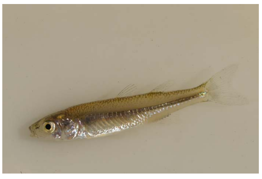
Figure 37 Lake Eyre Hardyhead. Retention Dam, Leigh Creek

This widespread arid arid-adapted Secure mid-water schooling species ( Craterocephalus eyresii ) can tolerate a wide range of salinity and temperature occurs opportunistically in many waterbodies that are flow-linked to refugia waterholes during rains.