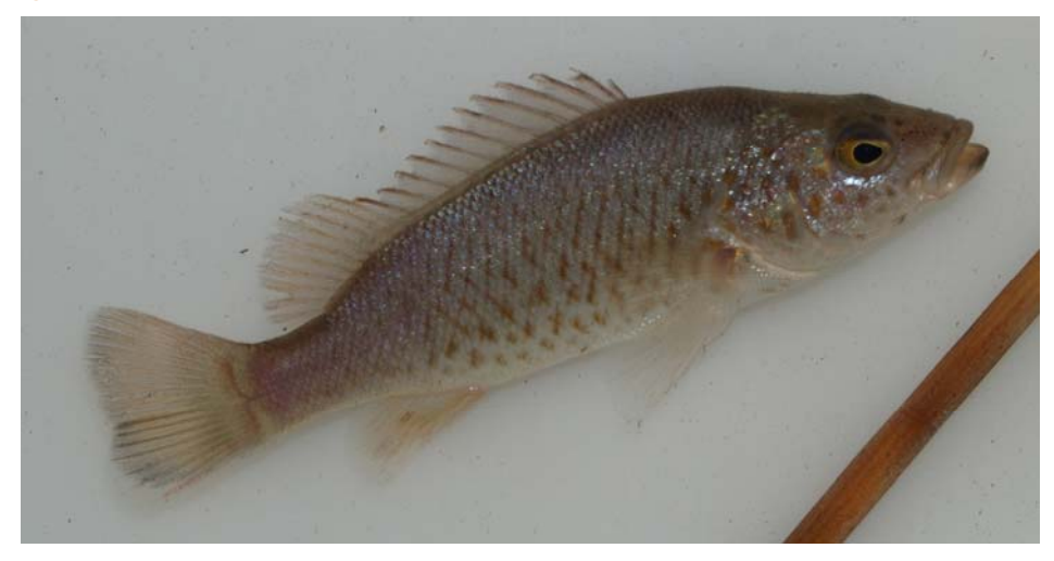
Figure 40 Spangled Grunter, St Mary's Pool, MacDonnell Creek.

This most widespread arid arid-adapted Secure mid-water species ( Leiopotherapon unicolor ) can tolerate a wide range of water quality and is very aggressive towards other species. These characteristics help to explain its sole persistence in many drought-reduced waterbodies and why smaller species disappear. It occurs in flow-linked refugia waterholes and during and following rains and it has remarkable capacities to disperse to other water bodies in rain-flooded country.