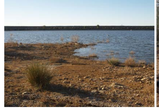
Figure 13 Site 12, Retention Dam, Leigh Creek.