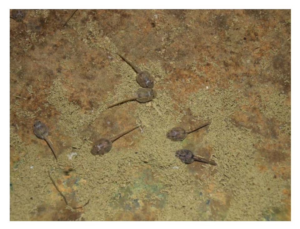
Figure 29 Flinders Springs Froglet ( Crinia sp nov) tadpoles. Angaroonoy Springs. Note tail damage in some due to dragonfly larvae attacks.

Figure 28 Flinders Springs Froglet ( Crinia sp nov) Narrina Spring. Smooth back morph on left and lyrate back morph on the right.