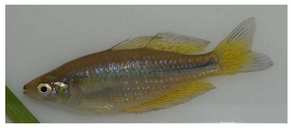
Figure 39 Desert Rainbow Fish, St Mary's Pool, MacDonnell Creek.

This generally widespread but locally restricted Secure arid-adapted mid-water species ( Melanotaenia splendida tatei ) is to date in the Flinders Ranges area only known from the Saint Marys Pool group of waterbodies in MacDonnell Creek and from Myrtle Springs. It is probably has narrower ranges of tolerance for temperature and salinity than other arid-adapted species.