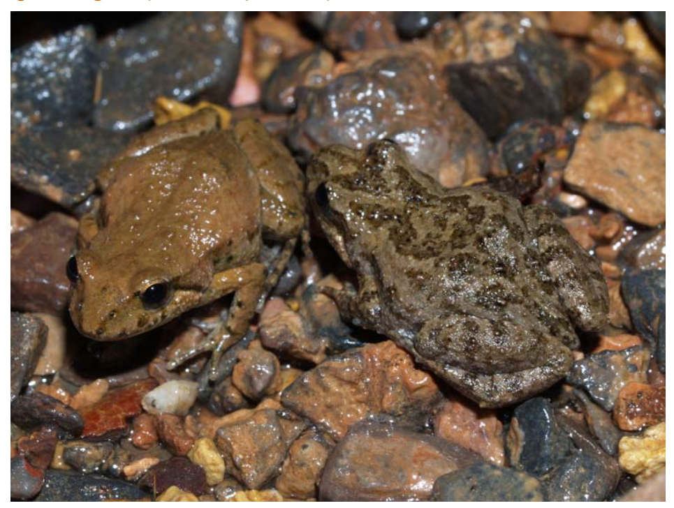
Figure 28 Flinders Springs Froglet ( Crinia sp nov) Narrina Spring. Smooth back morph on left and lyrate back morph on the right.

The Flinders Stream Froglet ( Crinia riparia ) and the Flinders Springs Froglet ( Crinia sp. nov.)