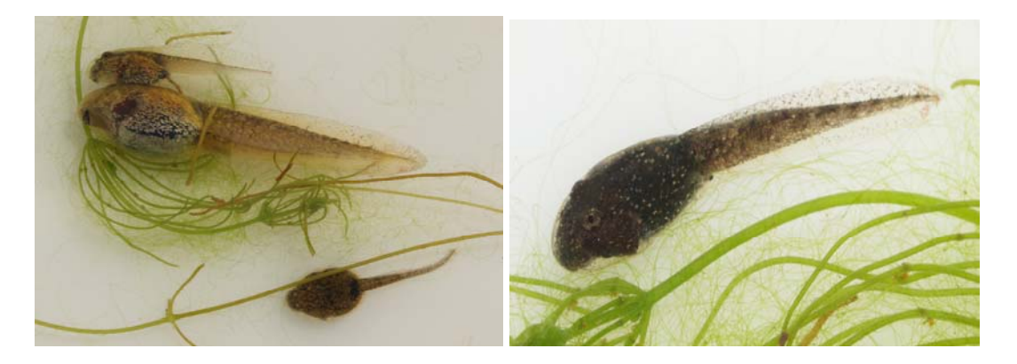
Figure 30 (left) Site 24 two small and one large paler Crinia sp nov tadpoles, note distal tail damage in smaller tadpoles, due to dragonfly larvae predation attempts. From deep main pool.

The persistent drought conditions during this pilot study limited the amount of work that could be done on the Flinders Springs Froglet ( Crinia sp. nov.). None-the-less its known distribution was extended northward to Walparindina Springs on Mount Freeling Station. This location confirms the species in the northward-flowing MacDonnell Creek which is part of the Lake Blanche/Strzelecki Creek sub-drainage of the lake Eyre Basin. This creek system is also important for fishes and highlights the need for further evaluations and better management of the biodiversity of the northward flowing watercourses.