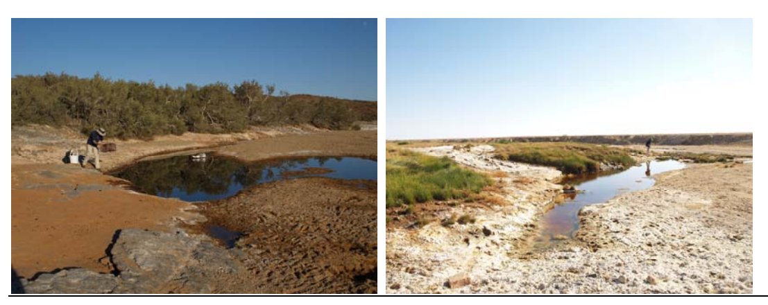
Figure 19 (left) Site 17, first Chimney Springs, Petermorra Creek. Setting fish trap.

Figure 20 (right) Site 18, second Chimney Springs, Petermorra Creek. Mound spring vent to left and another in centre of view, note salt.