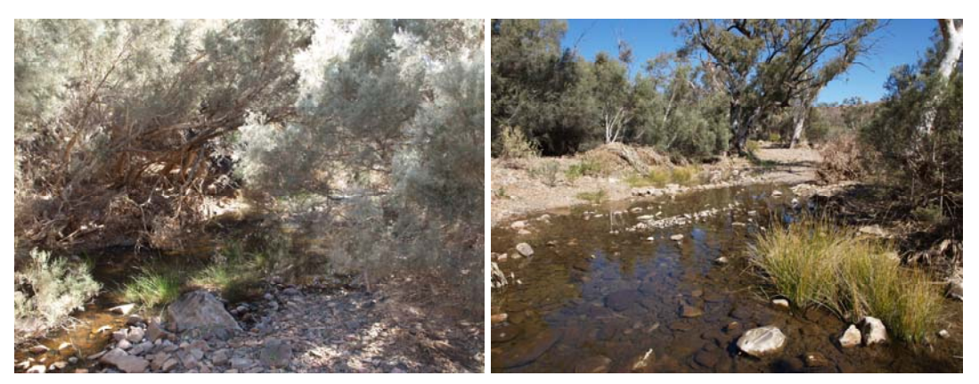
Figure 11 Site 10, Aroona Creek pool 250 m downstream of Dam.