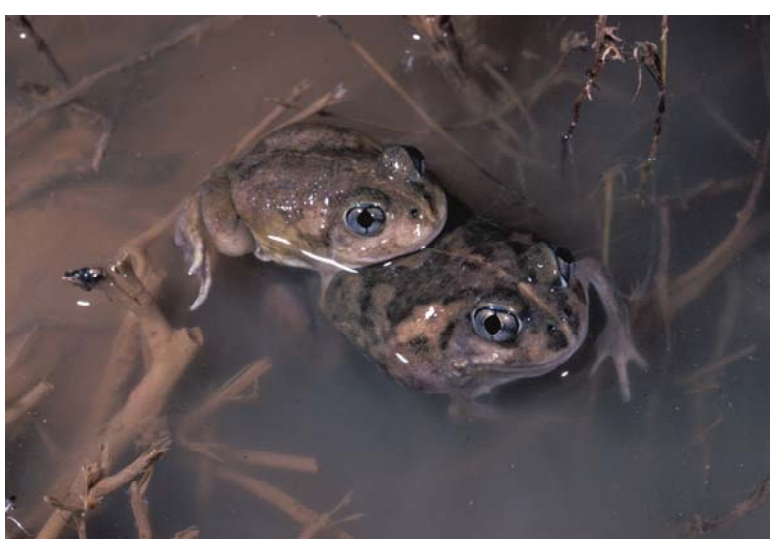
Figure 33 Breeding Desert Trilling Frogs in amplexus.

This widespread arid-adapted Secure burrowing species ( Neobatrachus centralis ) occurs in areas with softer homogeneous soils esp. sands on plains and footslopes associated with the Flinders Ranges. It is an opportunistic breeder with a preference to breed in warmer months. The species is mostly cryptic and remains underground in its own vertical back-filled shaft during dry weather, but following rains many