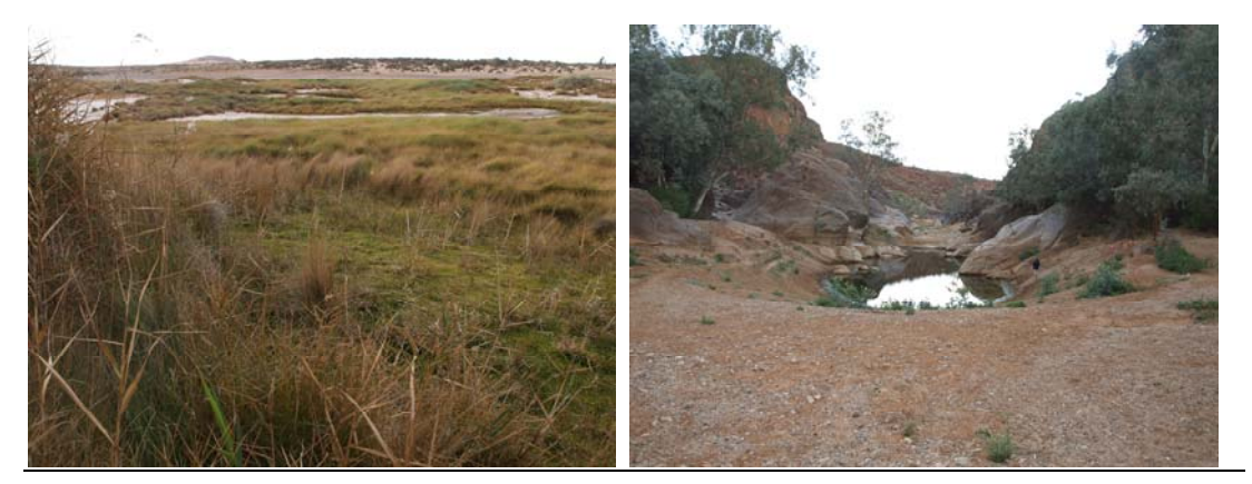
Figure 23 (left) Site 23, Twelve Springs complex, to Yerila Creek. Moolawatana Station. Figure 24 (right) Site 24, Terrapinna Springs, Hamilton Creek. Moolawatana Station.

Figure 22 (right) Site 20, fourth Chimney Springs, Petermorra Creek. The deepest pool seen.