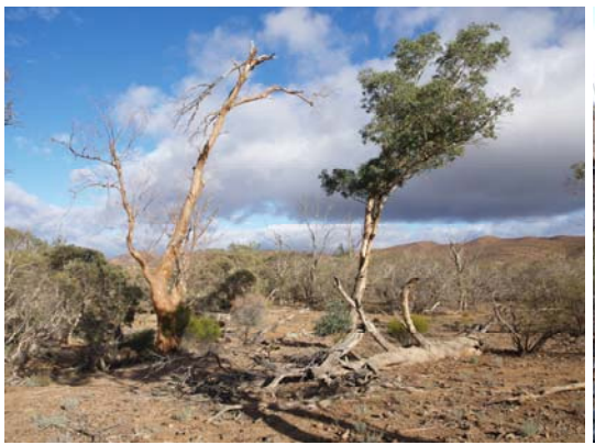
Figure 7 Site 7, Big Spring creek bed with extensive tree dieback and death probably due to sustained water stress.

Figure 6 Site 6, Bora Bora Spring in background, with rain filled pools in foreground.