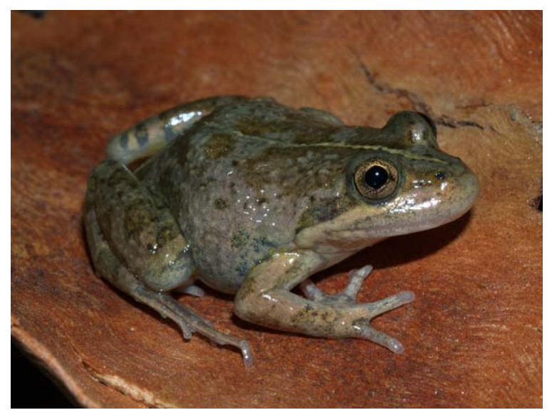
Figure 32 Spotted Marsh Frog (Limnodynastes tasmaniensis). Parawilia Waters.

This widespread Secure species ( Limnodynastes tasmaniensis ) occurs in more reliable watercourses in the ranges and some associated lower lands and plains where it can shelter in deep well-shaded refuges. It is an opportunistic breeder with a preference to breed in cooler months.