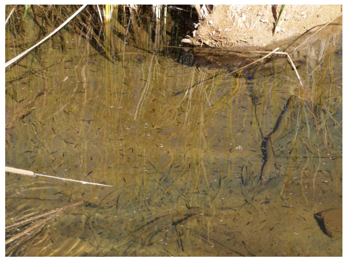
Figure 43 A large number of Plague Minnows ( Gambusia holbrooki ). Aroona Creek picnic area, 800 m downstream from Dam. The black fish shapes are the fishs' shadows, actual fish are easiest to see when they directly in line with shadowed substrate (see shadows of stick and rock).

The introduced pest Plague Minnow ( Gambusia holbrooki ) seems not to be widespread in the Flinders Ranges. This aggressive surface schooling fish that can tolerate wide fluctuations in temperature and oxygen availability is highly invasive and almost useless as a mosquito larvae control species.