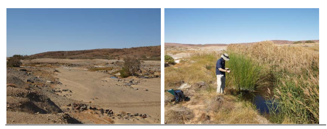
Figure 21 (left) Site 19, third Chimney Springs, Petermorra Creek. Several mound springs, vehicle crossing (tracks).

Figure 20 (right) Site 18, second Chimney Springs, Petermorra Creek. Mound spring vent to left and another in centre of view, note salt.