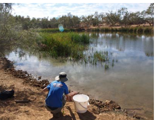
Figure 14 Site 14, main upstream pool St Mary's Pool complex, MacDonnell Creek.