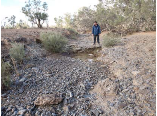
Figure 8 Site 7, Big Spring creek bed with massive natural concrete associated with past sustained waterflows. Pool of recent rainwater.

Figure 6 Site 6, Bora Bora Spring in background, with rain filled pools in foreground.