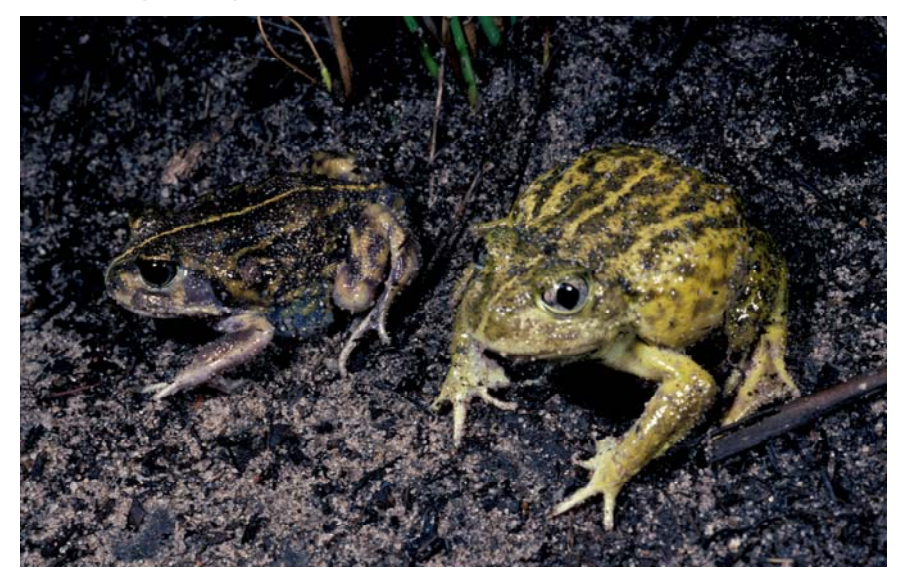
Figure 34 Painted Trilling Frogs, male on left, female on right.

This Secure burrowing species ( Neobatrachus pictus ) is largely distributed to the south of the Flinders Ranges but does get into their southern half. It occurs in areas with softer homogeneous soils esp. sandy clays on plains and footslopes. It is a winter breeder. The species is mostly cryptic and remains underground in its own vertical back-filled shaft during dry weather, but following winter rains it is active on the surface. At such times it is not as explosively abundant as the Desert Trilling Frog (Ehmann 2007).