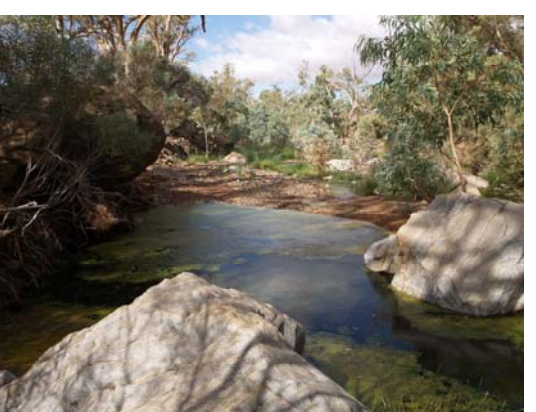
Figure 10 Site 9, Nepowie Spring creek pool looking downstream to the east.

The 26 visited sites and their field-assessments are given in Table 3. Most sites examined were also photographed and some of these are in Figures 1 to 27.