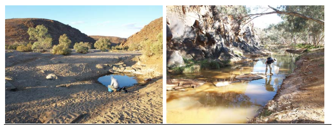
Figure 25 (left) Site 23, Brindana Springs and pool, Hamilton Creek. Mt Freeling Station. Figure 26 (right) Site 24, Walparindina Springs and pools, MacDonnell Creek. Mt Freeling Station.