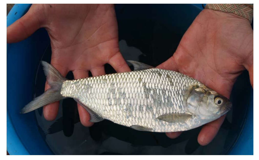
Figure 36 Bony Bream, St Mary's Pool, MacDonnell Creek.

This widespread arid arid-adapted Secure mid-water and near-bottom species ( Nematolosa erebi ) occurs in many deeper waterbodies that are flow-linked to refugia waterholes during rains.