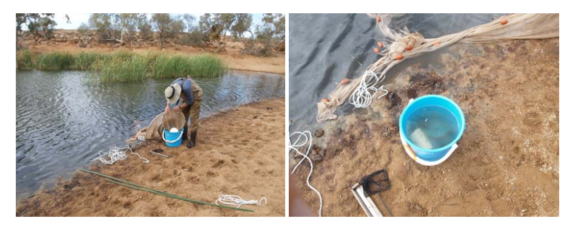
Figure 15 Site 14, main upstream pool St Mary's Pool complex, MacDonnell Creek. Clearing the fyke net into sorting bucket.

Twelve voucher specimens of three species of frogs (the northern undescribed taxon of Flinders Ranges froglet Crinia sp nov, the Spotted Marsh Frog Limnodynastes tasmaniensis , and the Desert Tree Frog Litoria rubella ) and about 35 voucher specimens of seven species of fishes have been lodged in the South Australian Museum. See Table 4.