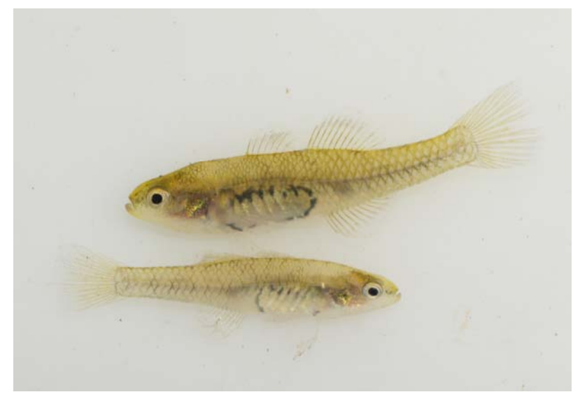
Figure 41 Carp Gudgeon. Retention Dam, Leigh Creek.

This generally widespread but locally restricted Secure arid-adapted near-bottom species ( Hypseleotris klunzingeri ) can tolerate a range of salinity and temperature and occurs in a few low-gradient waterbodies around the Flinders Ranges. It is known from Saint Marys Pool and the Leigh Creek Retention Dam.