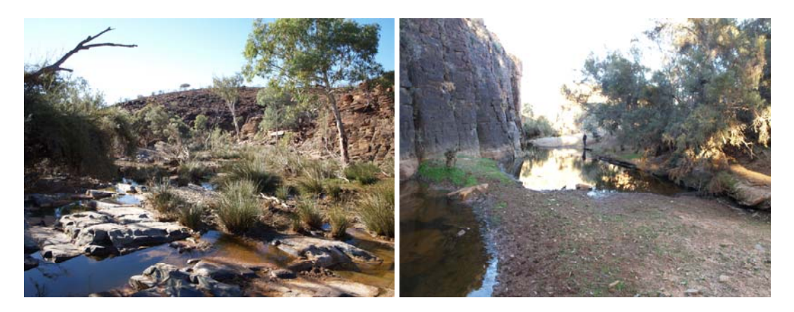
Figure 3 Site 3, Angaroonoy Springs, upstream and north of the main deeper cliff-base pools.