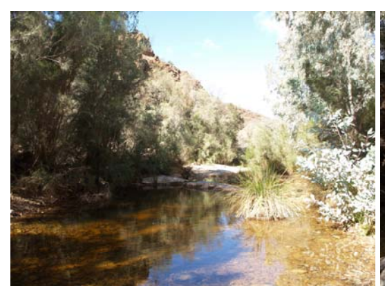
Figure 9 Site 8, Moro Gorge Creek (nearby spring fed) at vehicle crossing.