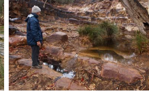
Figure 5 Site 5, Narrina Spring and deep rock pools. Searching for Crinia sp nov.